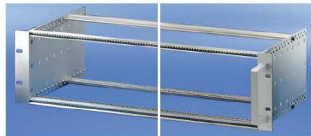
Without front handle 06102007 With front handle 0611003