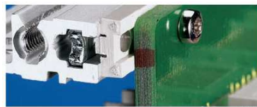
Rear horizontal rail for backplane mounting with insulation strip 0610001