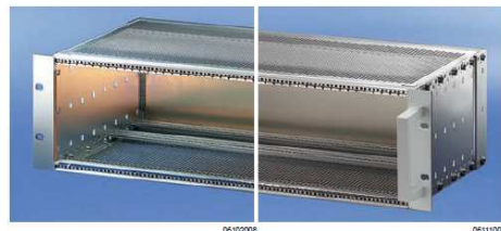
Without front handle 06102008 With front handle 0611001