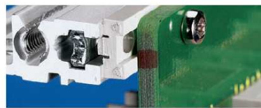
Rear horizontal rail for backplane mounting with insulation strip

D = overall depth, D1 = insertion depth, D2 = board depth = D1 - 15 mm