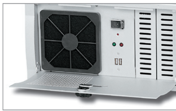
Plastic Fan Filter For easy cleaning and replacing