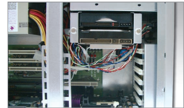
New HDD Drive Design Easy to install HDD drives