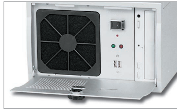
Plastic Fan Filter For easy cleaning and exchange