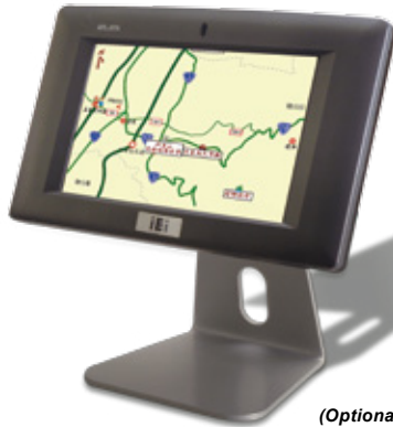
(Optional Stand Kit)