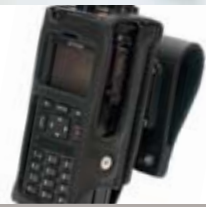
Hard leather case with 3" swivel belt loop, fits simple and full keypad models.

Enhanced receiver sensitivity and DMO repeater functionality means excellent coverage in buildings and over extended areas.