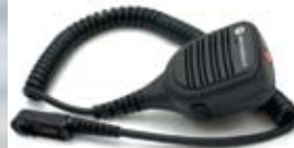
Enhanced large remote speaker microphone with noise-canceling microphone, loud audio, audio jack and emergency button, IP54.