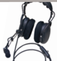
Dual-muff over the head headset with boom microphone and in-line push-to-talk, 24 dB NRR.